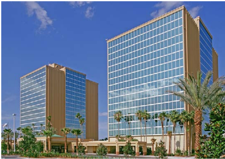
DoubleTree by Hilton Orlando, Florida at the Entrance to Universal Orlando

The 2017 NAGRA Training & Education Conference is a unique professional development event that brings together representatives from every corner of the gaming sector for the purpose of learning and discussing the latest industry developments, policy trends, and regulatory updates affecting the US, Canada, and European gaming markets. By providing a full array of plenary and breakout sessions presented by dynamic experts in their respective fields, the conference will offer attendees multiple opportunities to expand their knowledge base as well as their professional networks.